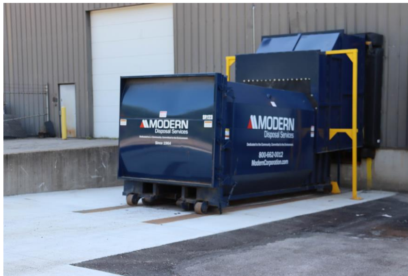
Almost all Confer Plastics trash is now put into an enclosed dumpster at our Wheatfield facility

We do maintain the small dumpster outside at our factory for bulk items (no plastic materials). That dumpster is emptied every 6 to 8 weeks.