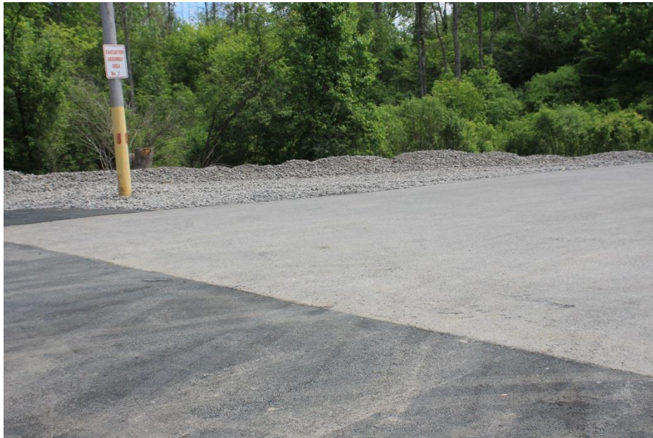
This berm next to the driveway and Donner Creek is 10" to 24" high

Berms have been built of earth and stone to prevent ground surface stormwater from taking pellets into Donner Creek.