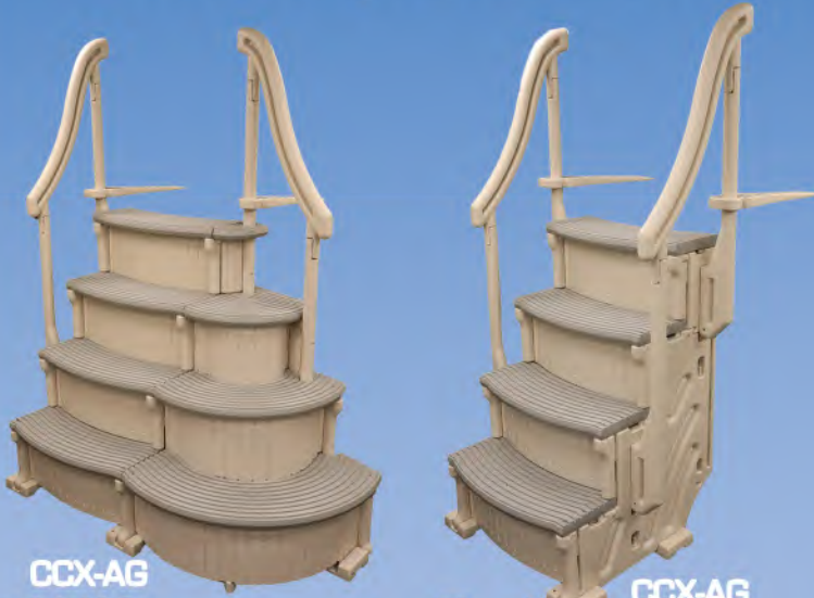
CCX-AG w/ Add-On

Discover the Curve Step and Its versatile options One Step Ahead – Customize Your Pool Step.