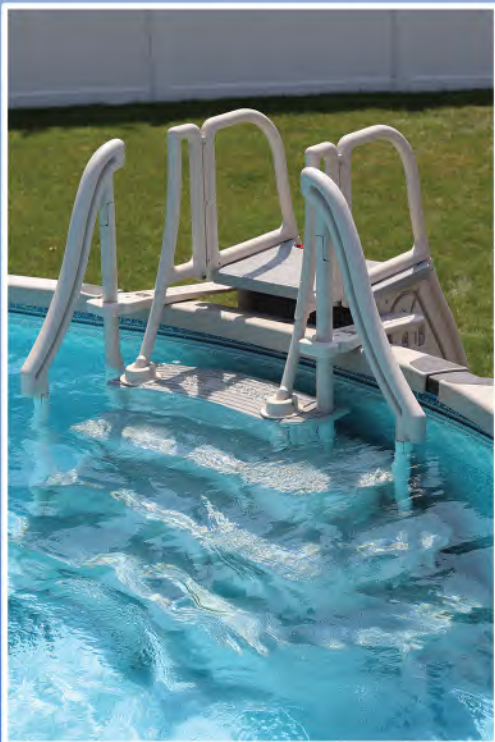
1x 9300 & CCX-AG w/ CCX-ADD