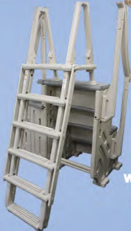
CCX-AG w/ Add-On & 8100X