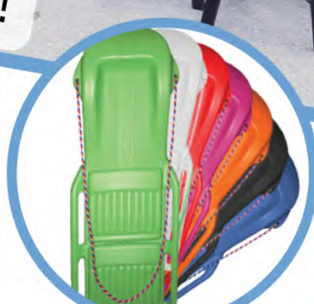
RETRO RACER SLEDS