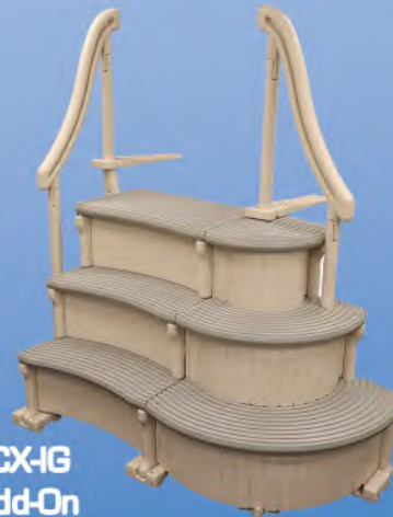
CCX-IG w/ Add-On