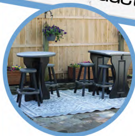
LEISURE ACCENTS PATIO FURNITURE